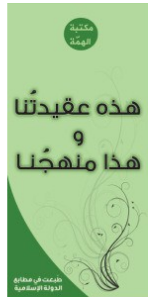
Takfir according to ISIS

This article will focus on the 40-points list on takfir because of its concise and easily digestible content which also directly addresses the topic at hand.