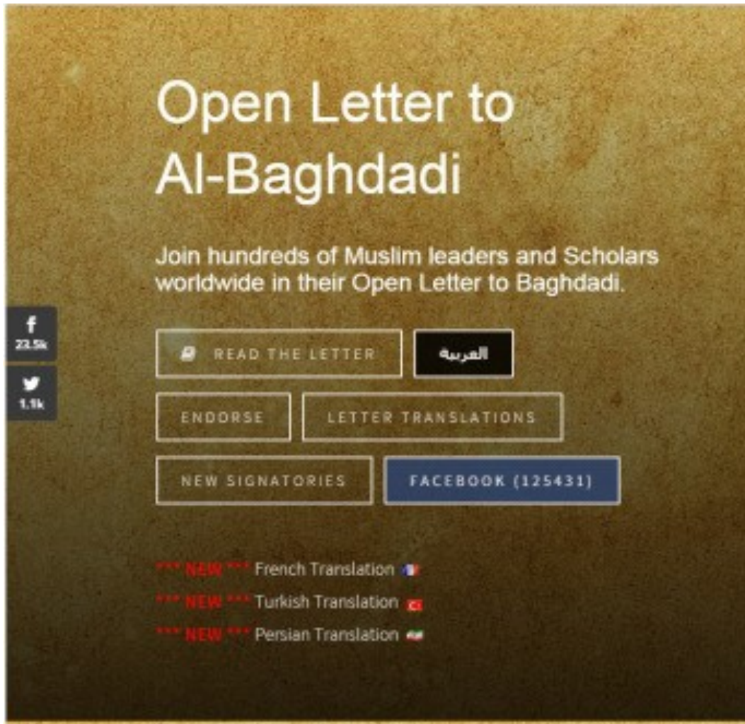
Open Letter to Al-Baghdadi

The third example is ISIS' pronouncement of holding Sunni Muslim scholars in high esteem and respect, although it also denounces those who take the crooked path and sell the religion for worldly pleasures.